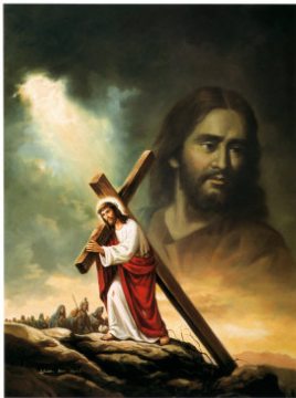
A woman's words that hold focus to the cross, but Love

A: Under current Church law in the Western Rite of the Church, a day of fast is one on which Catholics who are eighteen to sixty years old are required to keep a limited fast. In this country, one may eat a single, normal meal and have two snacks if necessary, so long as these snacks do not add up to a second meal. Children are not required to fast, but their parents are to ensure they are properly educated in the spiritual practice of fasting. Those with medical conditions requiring a greater or more regular food intake can easily be dispensed from the requirement of fasting by their pastor.